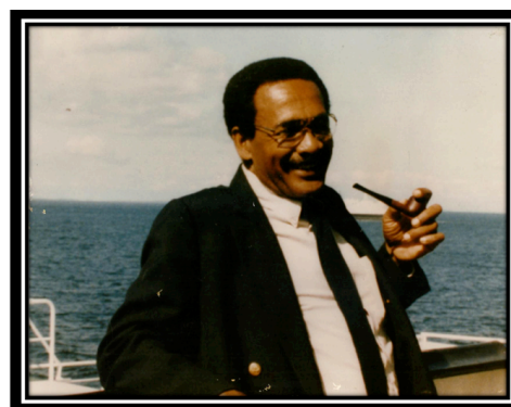
Neville Hall photo - Courtesy of the Department of History & Archaeology, the University of the West Indies, Mona.